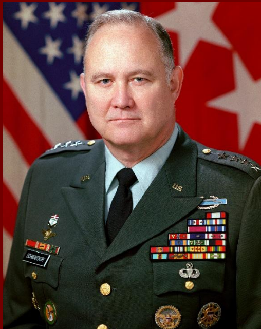
- Norman Schwarzkopf U.S. Army General

“Leadership is a potent combination of strategy and character. But if you must be without one, be without strategy.”