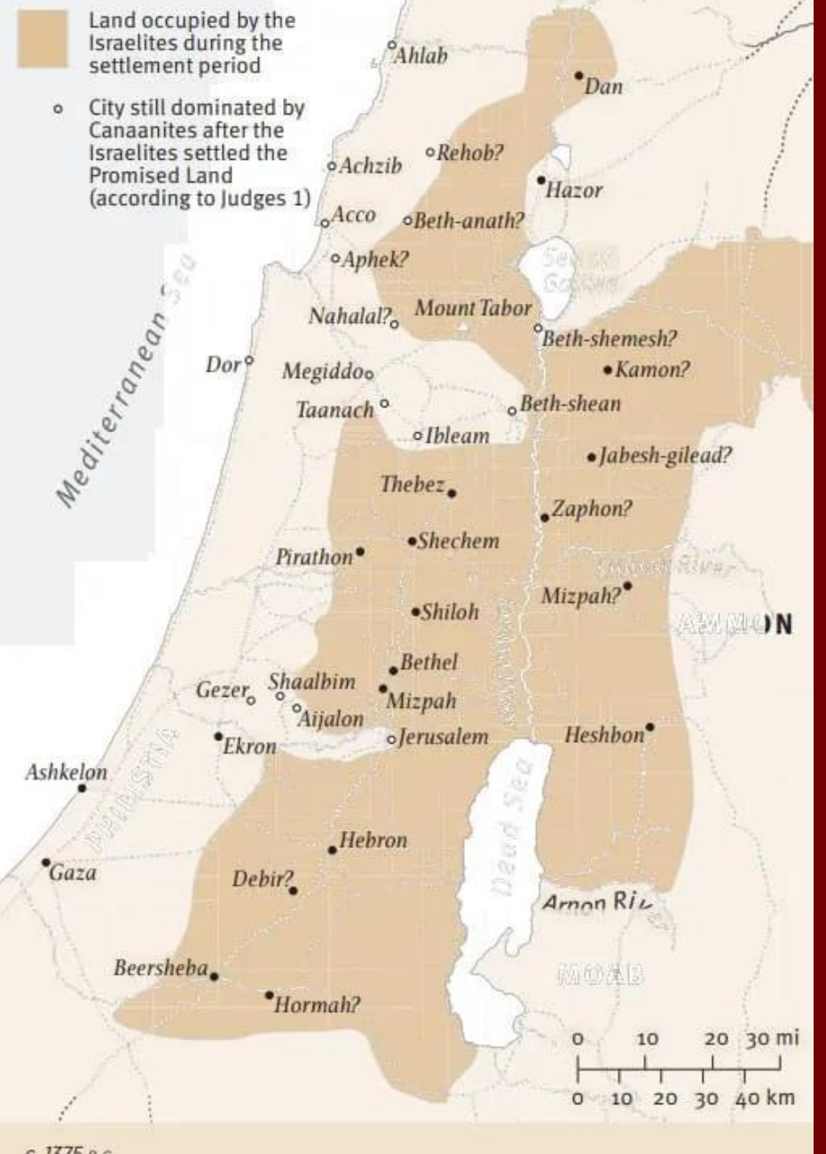
c. 1375 a.c.

The book of Joshua told the story of Israel's conquest of the Promised Land. But the conquest was not complete. The book of Judges tells of the various leaders raised up to deliver Israel from the enemies remaining in the land.