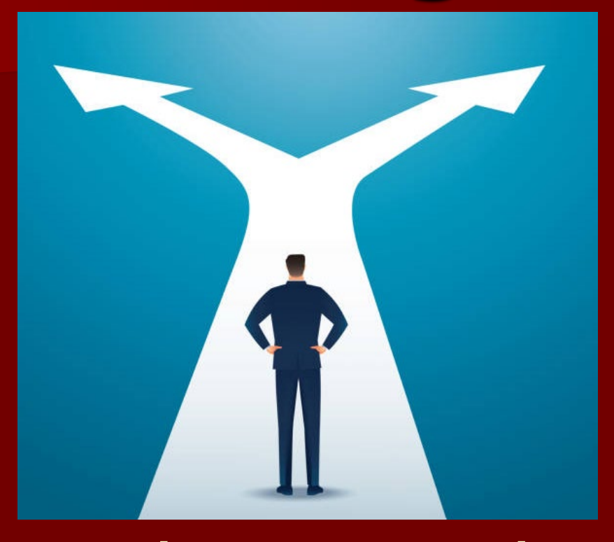
A Choice To Make