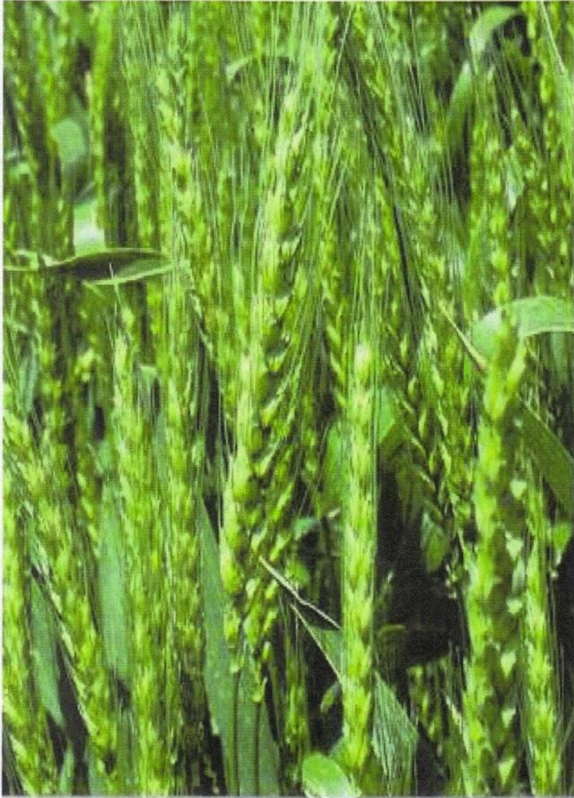
WHEAT: before it is fully ripe.