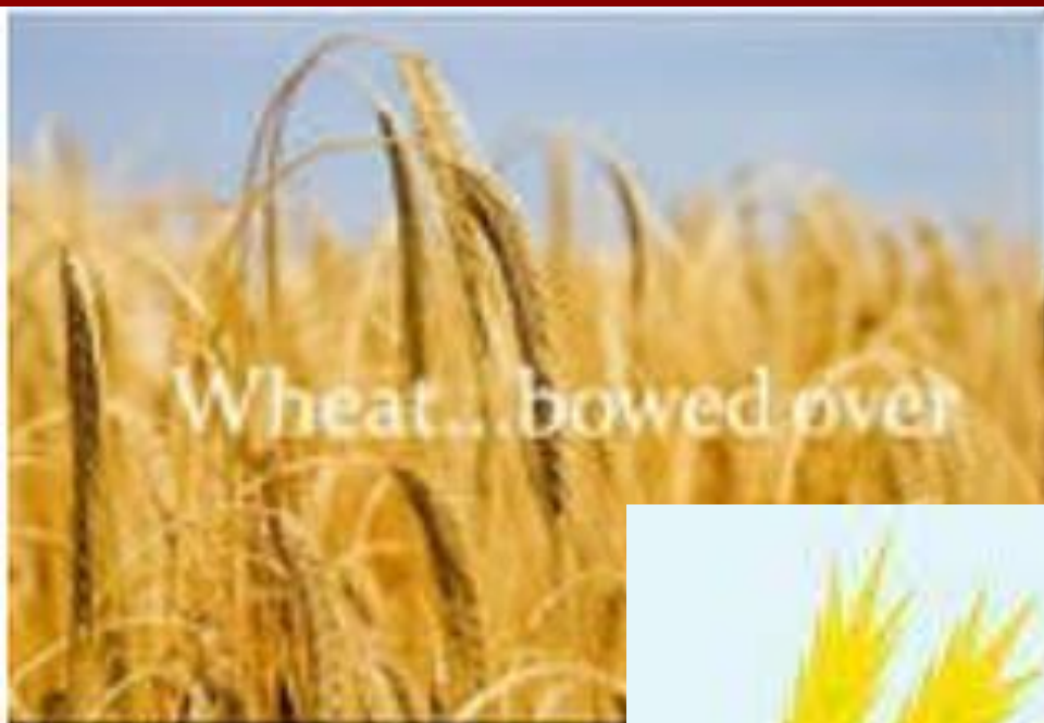
Wheat... bowed over