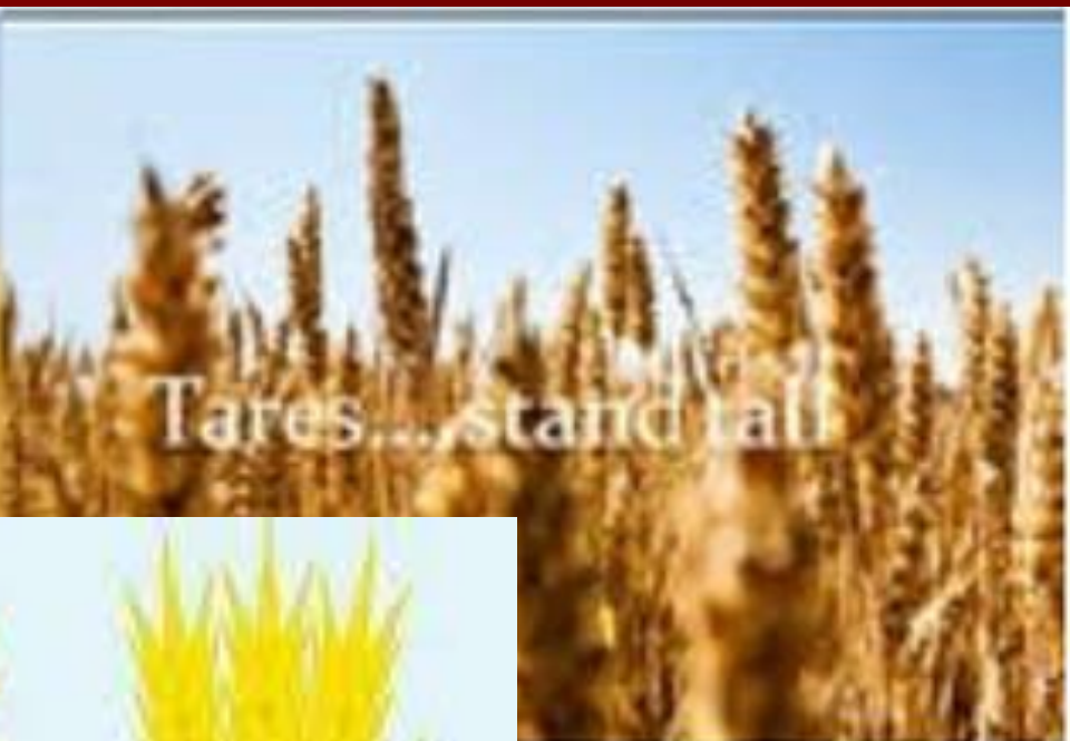
Tares... stand tall