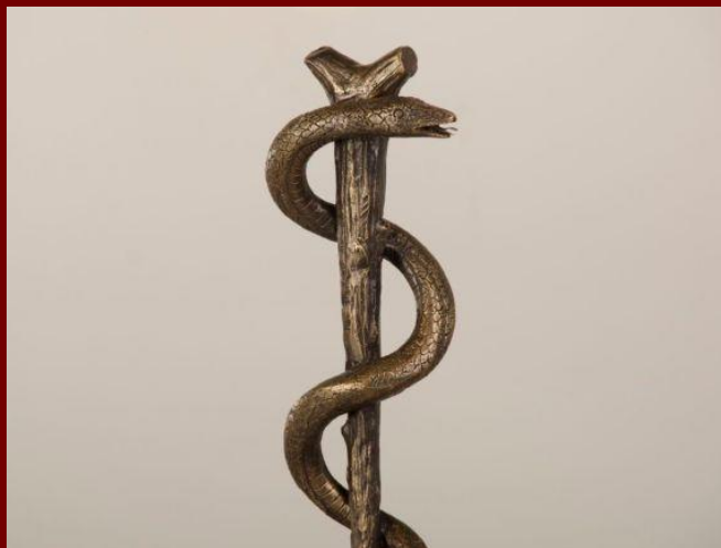
Asclepius with rod